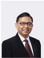
Imansyah Deputy Commissioner of OJK Institute and Digital Finance Indonesia Financial Services Authority